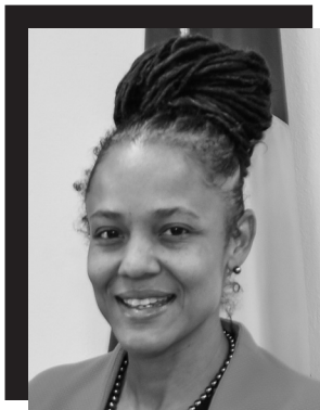
Hon. Santia Bradshaw, M.P.

It is indeed an honour that I introduce this booklet to you the parents and guardians of the students who will be writing the Barbados Secondary School Entrance Examination on Tuesday May 7, 2019.