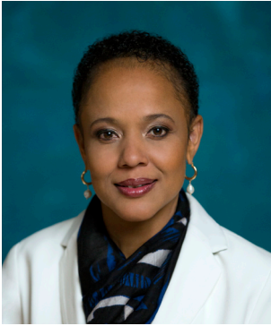
Hon. Santia J.O. Bradshaw, M.P.

It is with great pleasure that I introduce this booklet to you the parents and guardians of the students who will be writing the Barbados Secondary School Entrance Examination on Tuesday May 5, 2020.